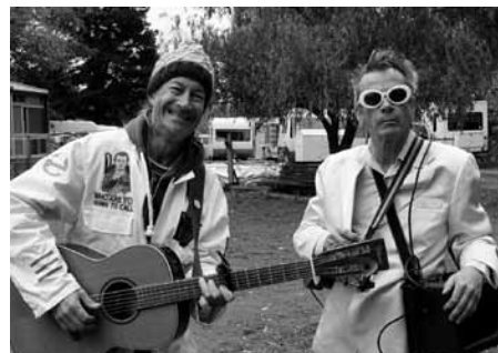
A couple of colourful characters getting ready for the 2019 kids parade

Please mark your calendar to join our very special family-friendly community created for a weekend of lively, foot-tappingly contagious entertainment.