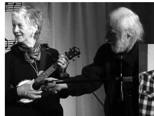
Seasoned veterans add their skills to make the blind dates a ton of fun