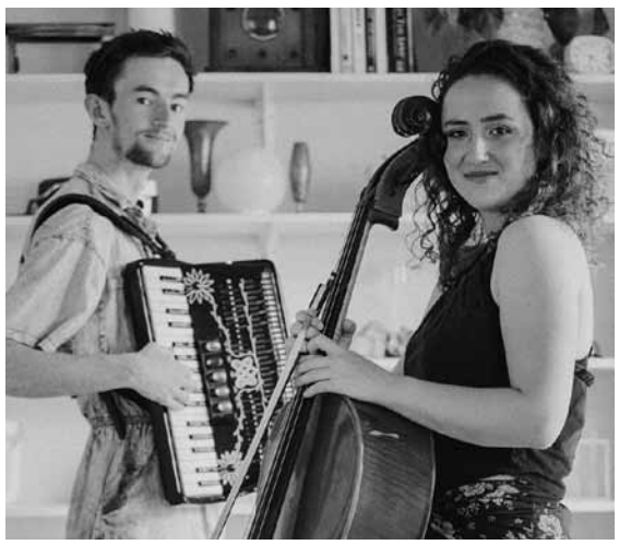
Workshop – 'Storytelling through Songwriting' Tickets: $20 workshop only / $15 if attending concert Time: 4 – 5 pm

Workshop go ahead will be announced 48 hours prior to ensure suitable attendance.